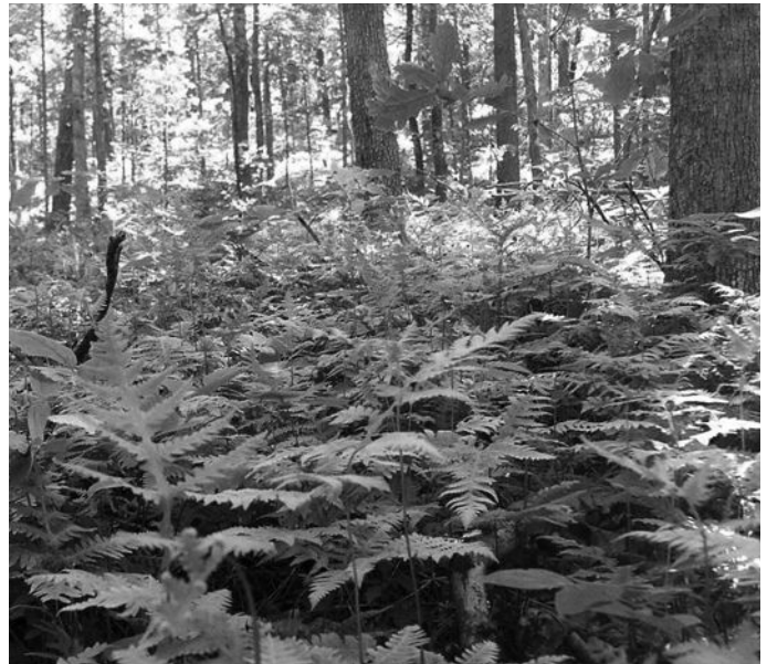
This photo was taken in July on a Perennis Chapter hike through the Indian Creek Wild Area at Trail of Tears State Park.