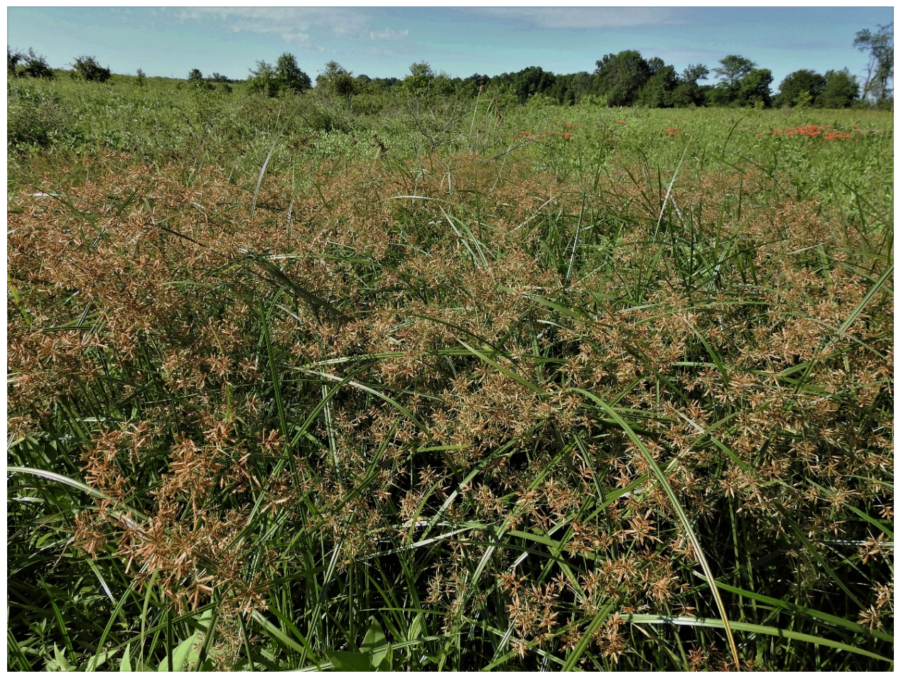
Figure 2. Large population of Cyperus setiger at the 2019 discovery site.

Due to the fact that all known translocations along the eastern boundary of Tucker Prairie did not survive after repeated searches, and the 300+ meters distance between the eastern and western boundaries, we believe the 2019 discovery is possibly a native occurrence. It is unlikely that plants translocated to the eastern edge of Tucker Prairie were the source of the large population growing near the western boundary because as noted, the translocated plants did not flower or persist. Since no seeds were produced by the transplanted population, the only potential movement of C. setiger 300 meters to the current extant location would be from rhizomes dug up by some unknown mammal species while the translocated plants were still alive. We find this possibility unlikely. Additionally, Tucker Prairie is located ca. 17 mi. WNW of Prairie Fork CA and it is extremely unlikely this was a source population for plants discovered on Tucker Prairie.