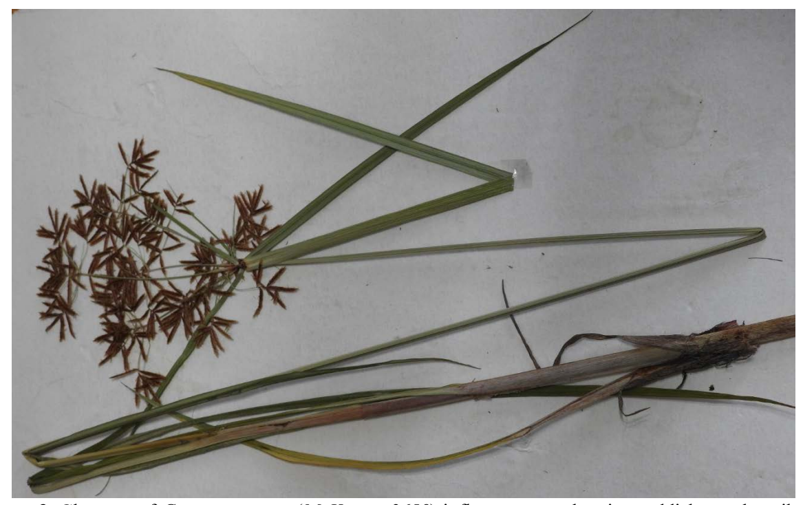
Figure 3 . Close-up of Cyperus setiger ( McKenzie 2659 ) inflorescences showing reddish-purple spikelets and long floral bracts.

In Boone and Callaway counties, C. setiger is one of the earliest flowering perennial species of the genus, with inflorescences present as early as late May and continuing through mid-June. Due to its combination of stout culms, long floral bracts, reddish-purple spikelets (Figs. 1 & 3), and long rhizomes that have a noticeable sweet smell, this species is not likely to be confused with any other perennial Cyperus in Missouri. Although the prairies in southwest Missouri have been intensively surveyed, Cyperus setiger has not been discovered in this region of the state. The species should be looked for in prairie swales as well as ditches, pond edges, and low depressions.