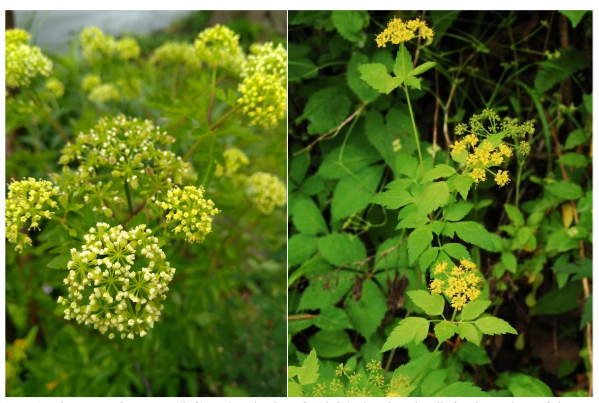
Figure 1 . Thaspium chapmanii (left) and T. barbinode (right) showing the distinctive colors of the open flowers in the field.

Peduncles and umbel rays of T. chapmanii are scabrellous (projections with acute apices) on their adaxial side and those of T. barbinode are glabrous to occasionally papillose-roughened (projections with obtuse apices) (Fig. 2). Mature fruits of T. chapmanii are smaller than those of T. barbinode (4–5 mm long vs. 5–6 mm) and minutely spinulose to scabrellous between the wings of the schizocarps (vs. glabrous or rarely scabrellous), although this character can be absent in late season collections of T. chapmanii when the whole stem has begun to senesce. The wings of the seeds develop well before the fruits are mature and only measurements of mature fruits will fall into the ranges provided. Differences not discernible from preserved specimens that are apparent in the field are the typically multi-branched habit of T. chapmanii and the generally larger umbel size which is in part because of the presence of a greater number of umbellules (9–16, vs. 6–12 in T. barbinode ).