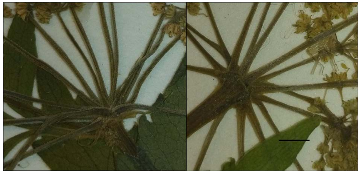
Figure 2 . Thaspium chapmanii (left) showing the scabrellous umbel rays, and T. barbinode (right) showing the glabrous umbel rays. Scale bar 2 mm.

overlaps, but T. chapmanii is typically later in reaching peak flowering from late May through June, whereas T. barbinode peaks in mid-May and continues into June. A key to the species following TNFC (2015) is presented below to delimit the species of Thaspium in Missouri.