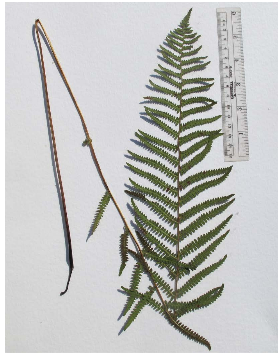
Figure 1. Thelypteris noveboracensis , Wayne Co., Missouri, showing fronds tapering at both ends and reduced proximal pinnae ( Brant 8934 ).

New York fern should be considered for State Listing as a species of conservation concern (SOCC) in Missouri as S1 since it is currently known from a single Missouri location.