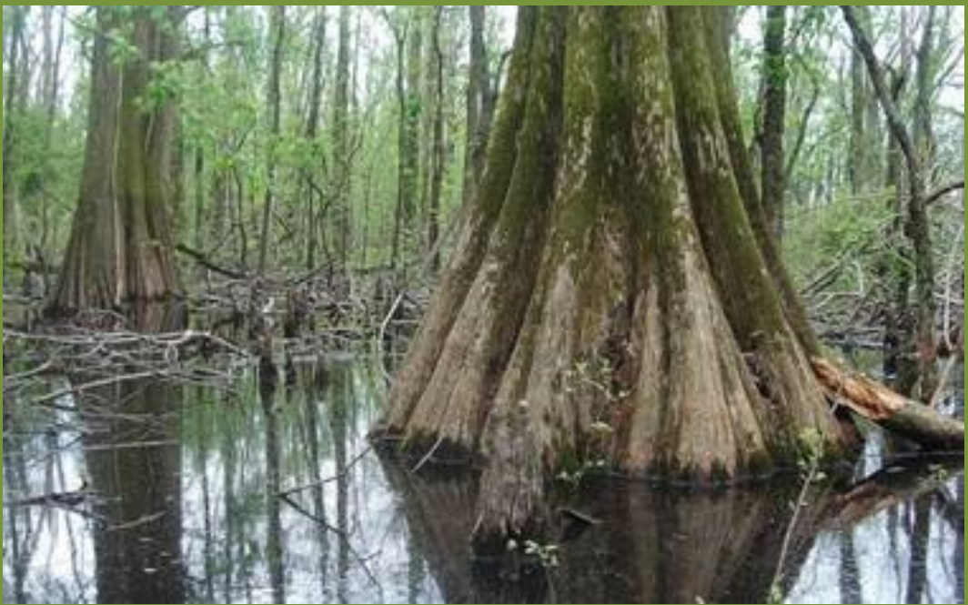
Big Oak State Park; article on p. 4.

Journal of the Missouri Native Plant Society