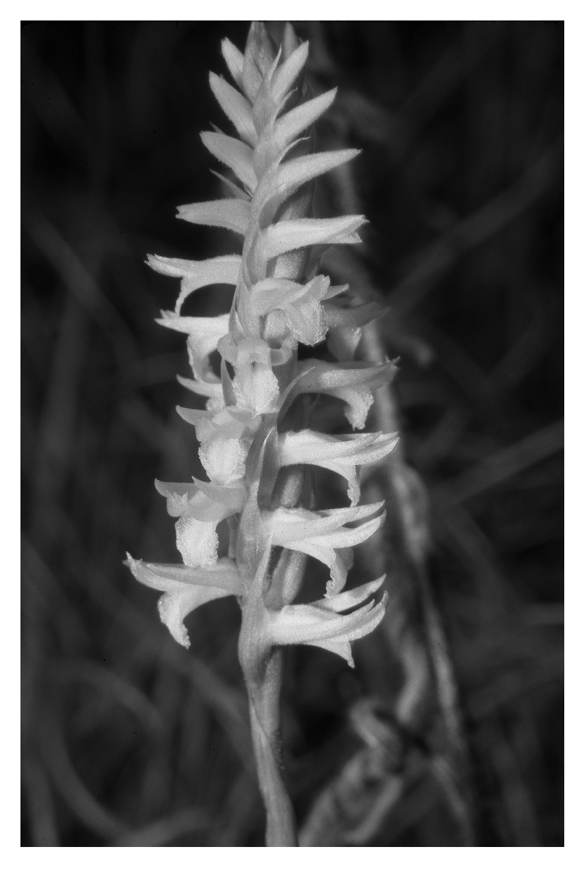
Spiranthes magnicamporum, Great Plains ladies' tresses.