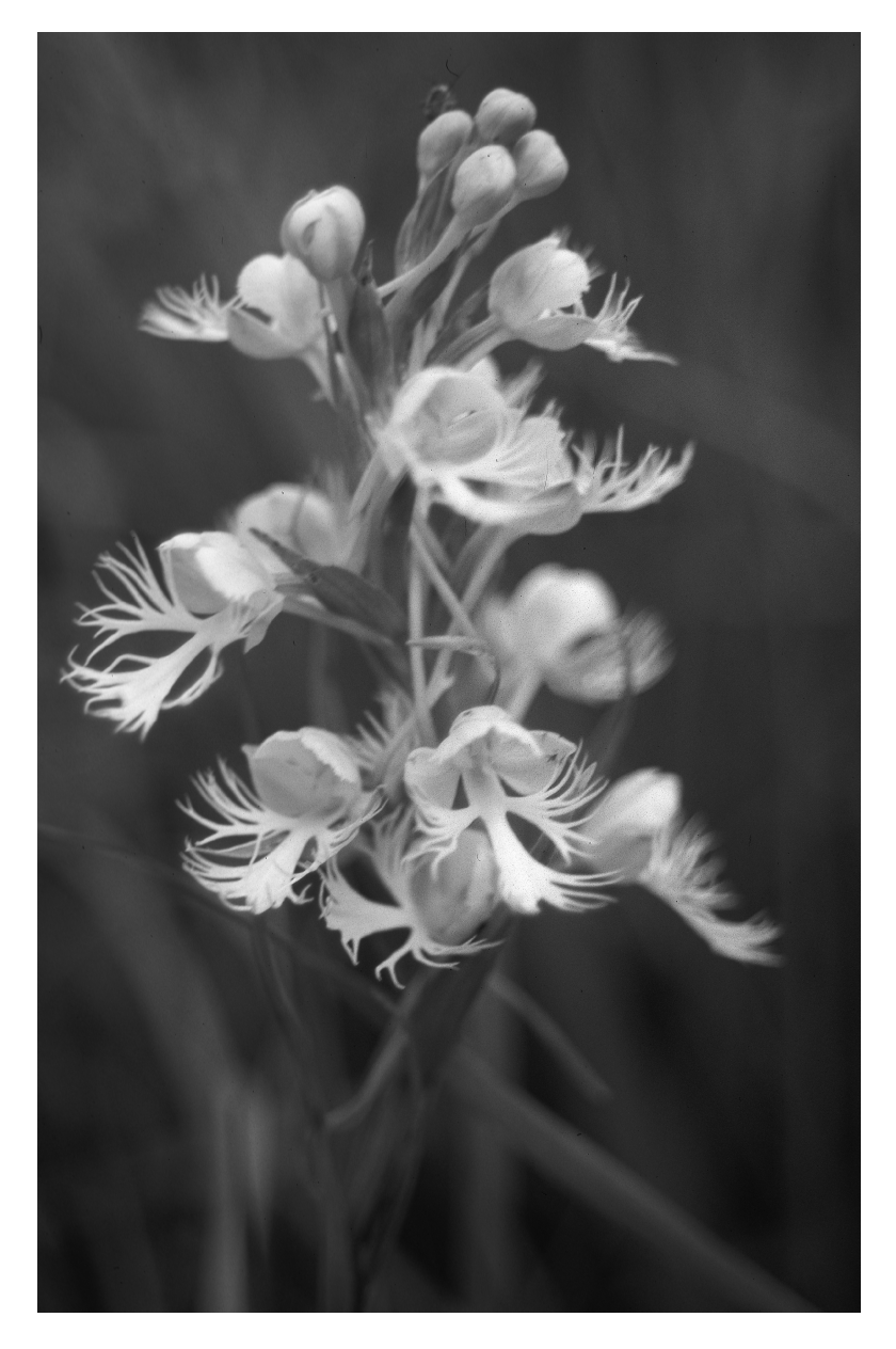
Platanthera leucophaea, eastern prairie fringed orchid.

disappear, preventing reproduction by seeds. With dwindling