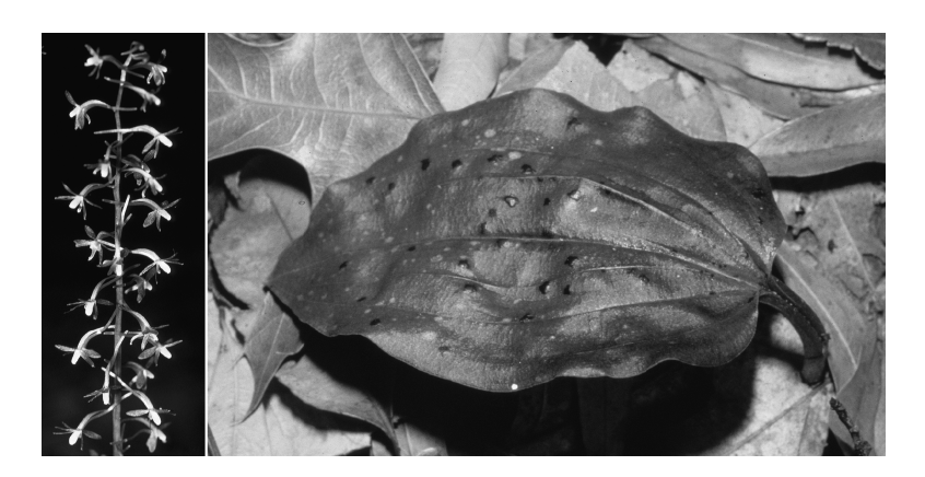
Tipularia discolor, cranefly orchid; inflorescence (left), leaf (right).

following weekend, I went to see Mark. It was a cold clear day in December, ideal weather for taking pictures. Mark took me to the site, and there they were; dark green leaves that had grown up through a bed of recently fallen oak leaves. There were small colonies of several leaves grouped together. The dark green leaves were veined with a bronze-green on the upper surface, and with dark warty spots. The lower surface was purple in color. The leaf picture on p. 102 of Missouri Orchids were taken at this site, whereas the flower picture on p. 101 was taken in Stoddard County.