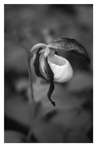
Cypripedium kentuckiense in Arkansas. Note large opening on the slipper.

Cypripedium kentuckiense C.F. Reed.—In the rugged mountainous regions of northwestern Arkansas occurs Kentucky lady slipper. Its range extends to the borders of southwestern Missouri. It favors woodland habitats along the wet margins of spring-fed